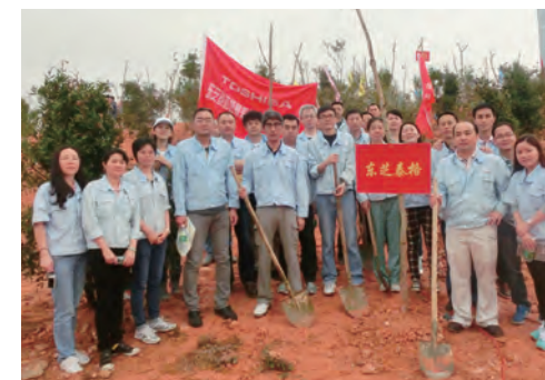
TOSHIBA TEC INFORMATION SYSTEMS (SHENZHEN) CO., LTD.