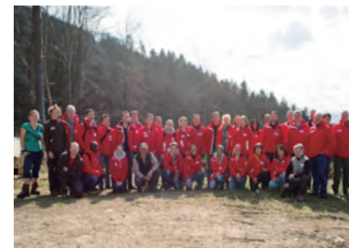
TOSHIBA TEC GERMANY IMAGING SYSTEMS GmbH