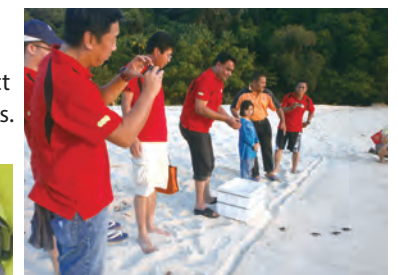
Green turtle protection conducted by TOSHIBA TEC MALAYSIA MANUFACTURING SDN. BHD.