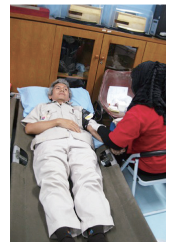
Blood drive at P.T. TEC INDONESIA

The blood drive is conducted continually every year and many employees participate in the blood drive.