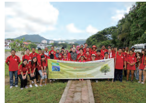
TOSHIBA TEC MALAYSIA MANUFACTURING SDN. BHD.

We take part in the "1.5 Million Tree-Planting Project" that the TOSHIBA Group works on with the aim of contributing to global environmental protection, around the world. We also actively participate in forest cultivation and tree planting activities in worldwide regions.